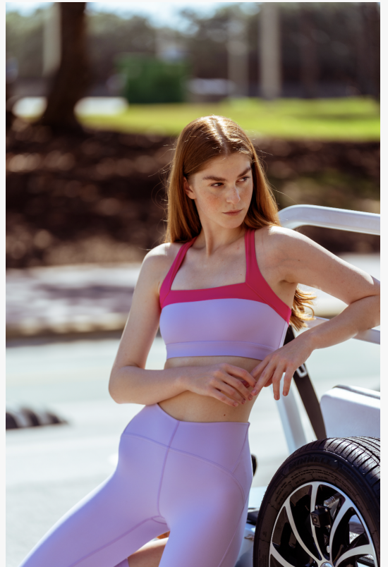
The Brooklyn Top in Fuchsia/Digital Lavender