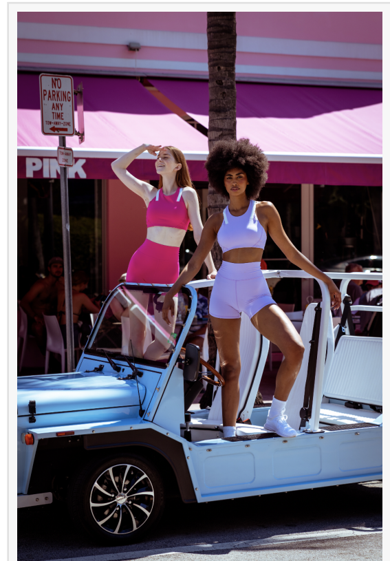
The Madison Top and Betty Biker Short