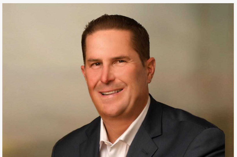
President and Managing Partner of Republic Urban Properties