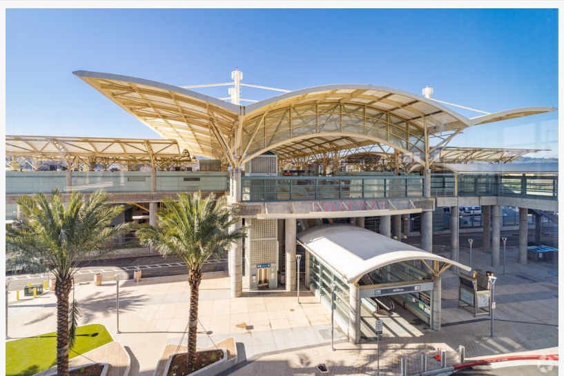
BART Station located steps away from Gateway at Millbrae Station

MILLBRAE, CA, USA, April 20, 2023 /EINPresswire.com/ -- Republic Urban Properties will celebrate the Grand Opening of its landmark Gateway at Millbrae Station community on Thursday, April 20th. Located at the nexus of BART, Caltrain, San Francisco International Airport, and Highway 101—as well as a future stop on California’s High-Speed Rail—Gateway is one of the largest transit-oriented developments west of the Mississippi. With 157,000 square feet of Class A office space, a 164-room hotel, 320 market-rate apartments, 80 veteran-preferred affordable housing units, and 44,000 square feet of mixed-use retail, Gateway also demonstrates how a public-private partnership between a developer, city, and super agency like BART can successfully transform underutilized land into an exciting new space bursting with economic potential.