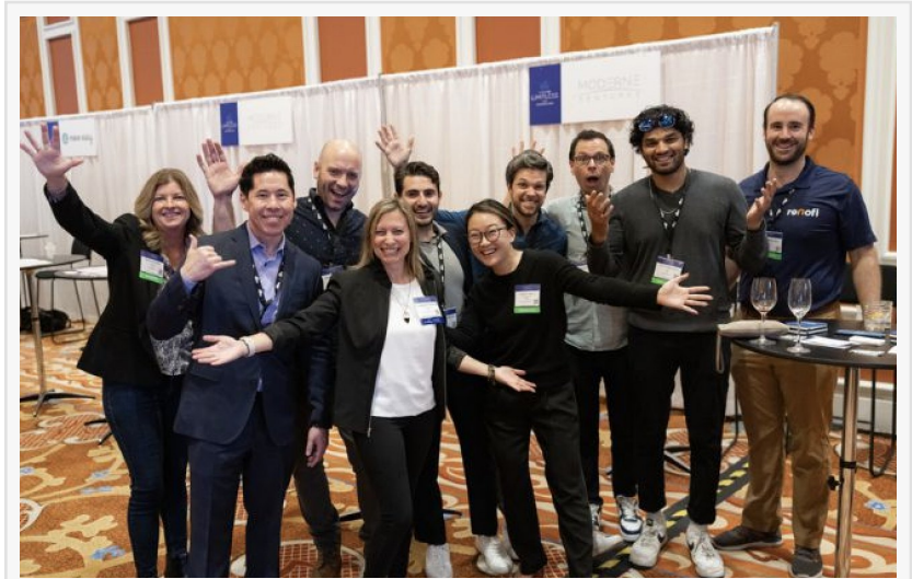
The Moderne Ventures team and 2023 Passport Program founders

BHR is a venture-backed proptech startup that enables access to all information about any residential property in the US, serving as the single source of truth for the real estate industry. For more information on BHR, please visit https://bhr.fyi/ .