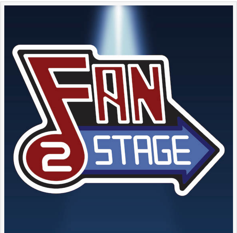
Fan2Stage Your Virtual Audience