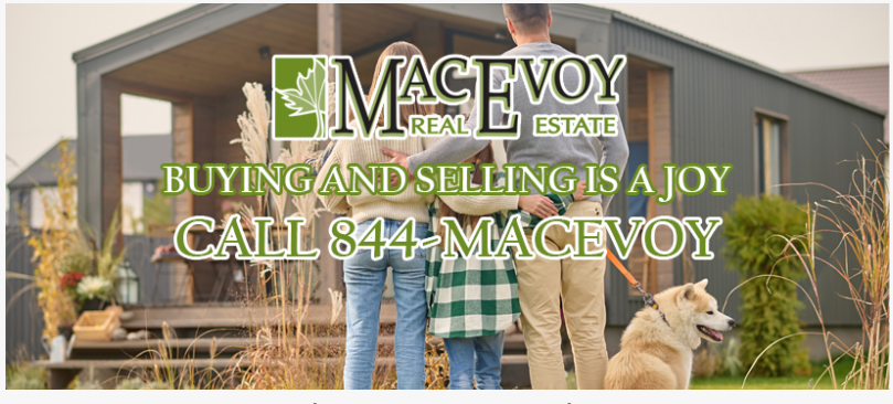
House Hunting with Mac Evoy Real Estate Co. +1 844-MACEVOY

Find Your Coastal View with Mac Evoy Real Estate Co. +1 844-MACEVOY