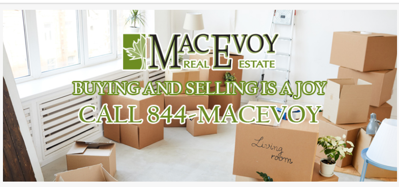
Move to the Treasure Coast with Mac Evoy Real Estate Co. +1 844-MACEVOY

process goes smoothly. They have the expertise and knowledge of the market that allows them to provide valuable insights into the local real estate market. Real estate agents also have access to multiple listing services (MLS), which gives them access to a vast network of properties and potential buyers.