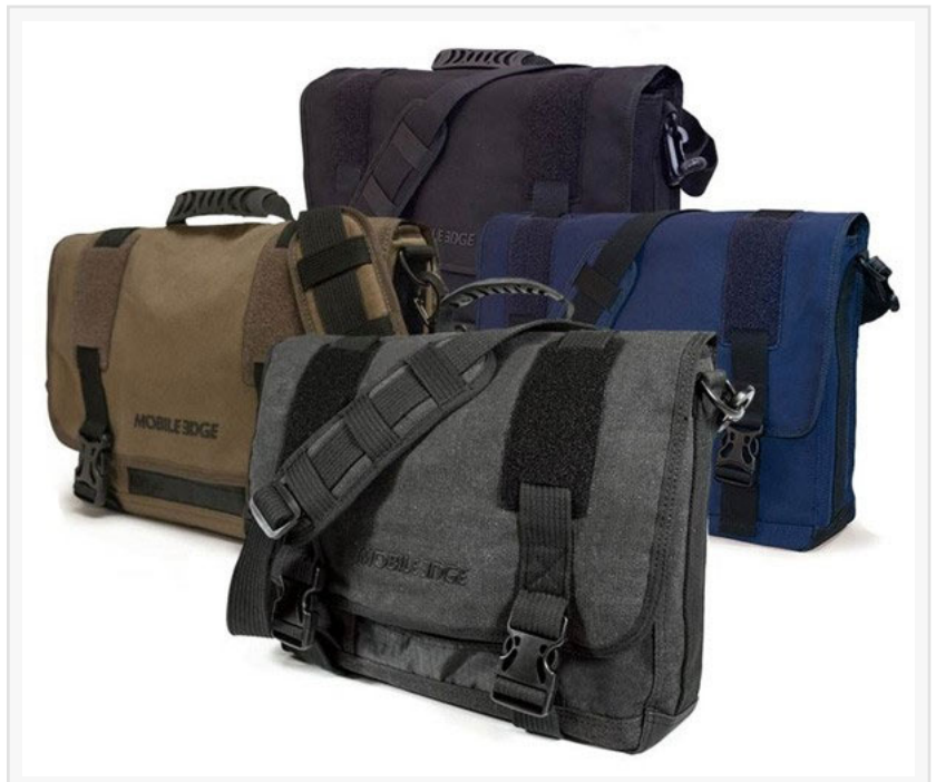
ECO Laptop Messenger Bags