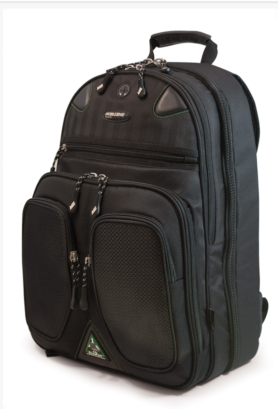
ScanFast™ Backpack 2.0

For those who prefer the look and functionality of a backpack, another eco-friendly option is the ECO Laptop Backpack. Like the ECO Messenger bag, this backpack features an all-natural cotton