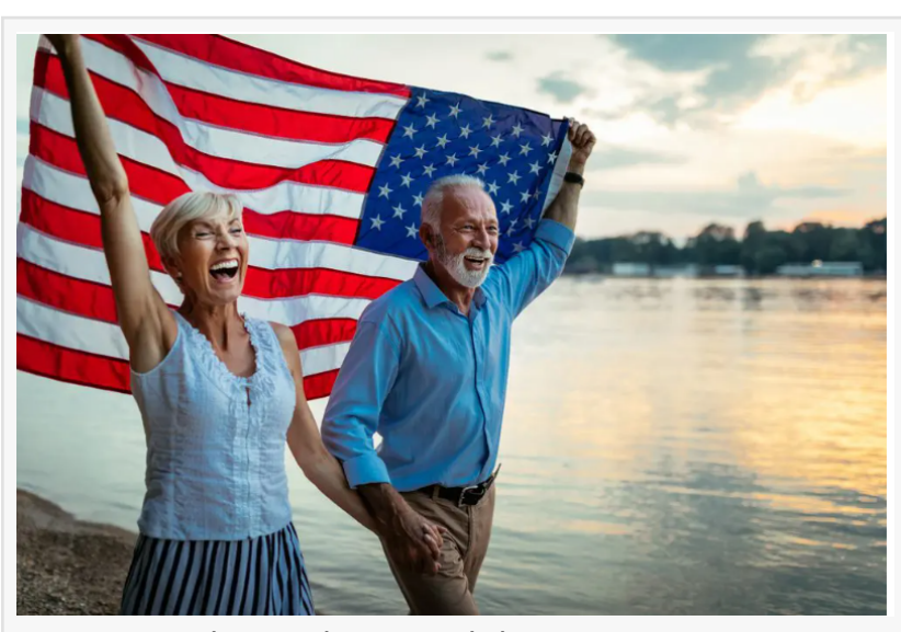
Patriot Funding Debt Consolidation Review

BLOOMFIELD HILLS, MICHIGAN, USA, April 20, 2023 /EINPresswire.com/ --Patriot Funding, a leading debt consolidation company, is proud to share several new success stories from clients who have achieved financial freedom through their personalized debt consolidation services. These testimonials highlight the company's dedication to providing a client-