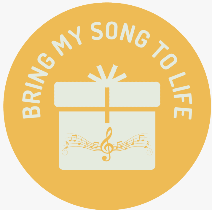
The Bring My Song To Life official logo

Bring My Song To Life's entry-level price for customized songs partially produced through AI is now $49, which is $150 less than their closest competitor. The base price for personalized songs