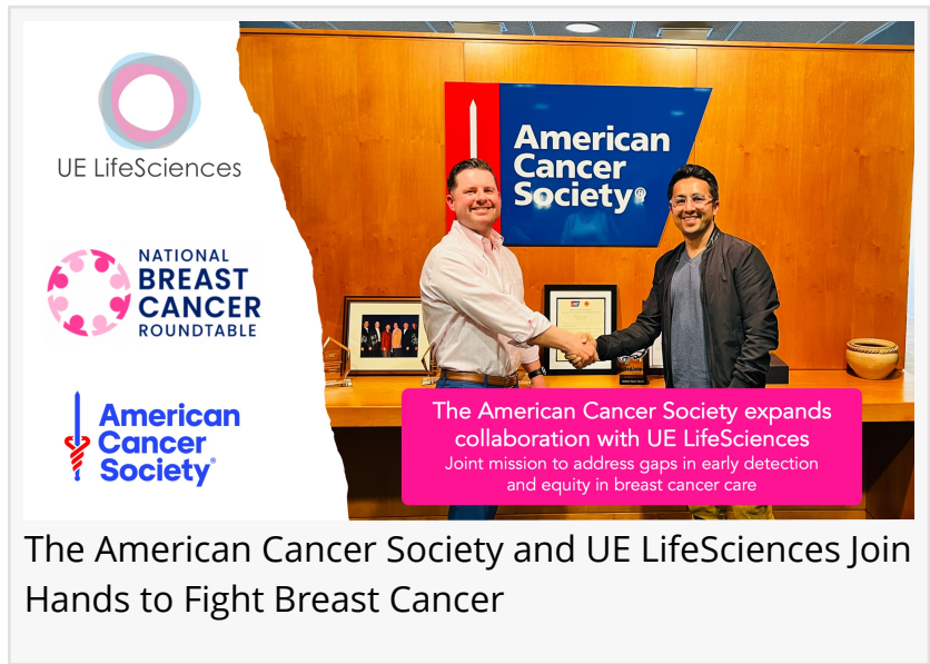
The American Cancer Society and UE LifeSciences Join Hands to Fight Breast Cancer

PHILADELPHIA, PA, UNITED STATES, April 21, 2023 /EINPresswire.com/ -- UE LifeSciences and the American Cancer Society are collaborating to address disparities and inequities in breast cancer care, through innovation and advocacy. The alliance will focus on addressing gaps in early detection and access to treatment. UE LifeSciences will support the American Cancer Society's National Breast Cancer Roundtable in its inaugural year and renew its support for American Cancer Society Cancer Action Network.