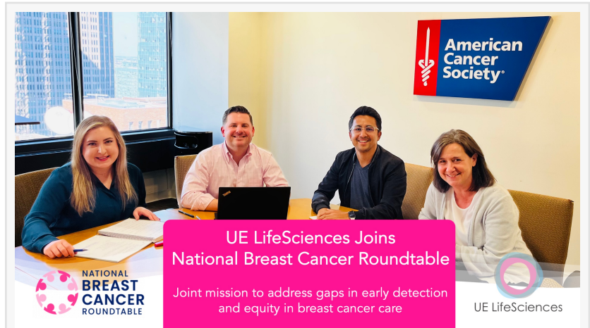
UE LifeSciences Joins American Cancer Society National Breast Cancer Roundtable