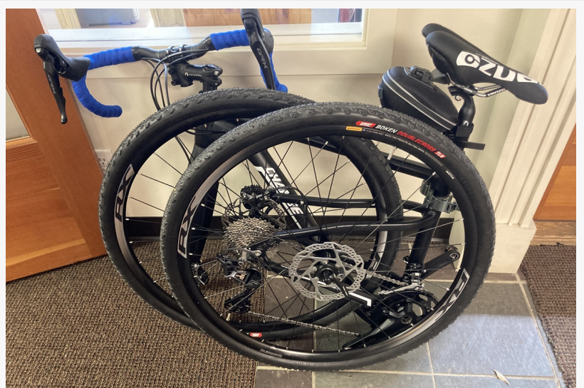
The CHANGE Road Warrior folds down to 37" x 30" x 15"

MONTEREY, CA, USA, April 21, 2023 /EINPresswire.com/ -- April 20, 2023, Monterey, CA. At this year's Sea Otter Classic bike show in Laguna Seca, Flatbike is introducing the CHANGE Road Warrior folding gravel bike. Until now, gravel bikes and folding bikes have been entirely different bicycles. But there is an excellent reason to bring these two worlds together.