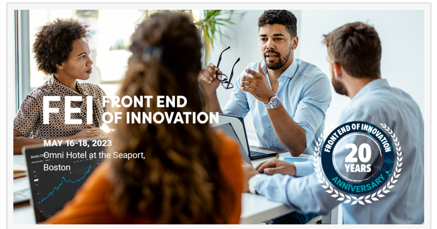
FEI: Front End of Innovation returns to Boston in May 2023 for 20th Anniversary Celebration

For more than two decades, Boston's innovation community has hosted FEI: Front End of Innovation, the annual meeting place for the innovation and R&D executives from Fortune 1000 organizations responsible for making innovation happen. Together, we strengthen connections and fuel the conversations that contribute to a thriving next-gen ecosystem – from identifying upcoming trends, forging collaborative partnerships, and unveiling first-look innovations.