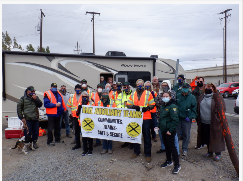
Rail Road Safety Classes RAT Pack Nevada

of both organizations is to prevent trespassers, a major source of railway deaths, and to prevent acts of terrorism. Through due diligence, technology, and teams of railway experts, these organizations are working to reduce railway deaths using integrated strategies including outreach. Learn more by visiting https://railaware.org/ .