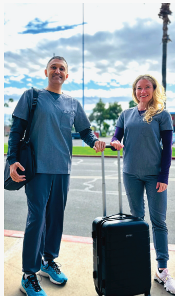
Arizona Mobile Dentistry