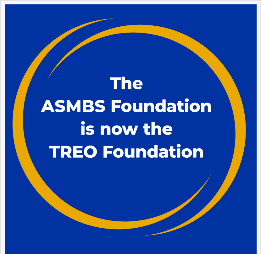
THE ASMBS Foundation IS NOW TREO. Foundation.