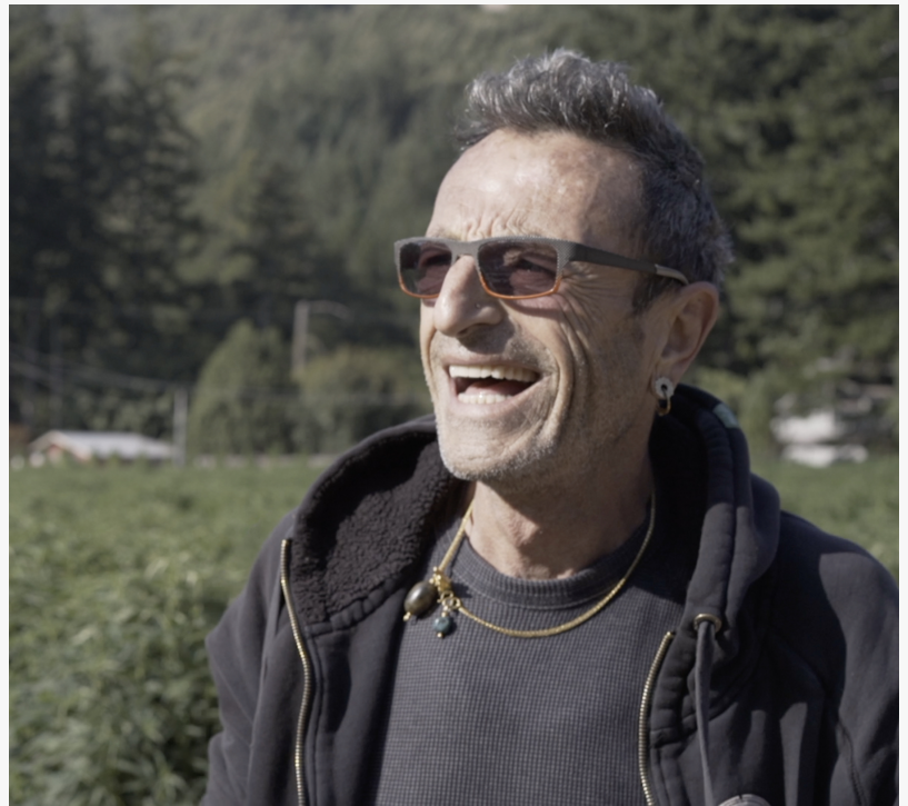
The beautiful cannabis fields of Empress Farms

This press release can be viewed online at: https://www.einpresswire.com/article/629626496 EIN Presswire's priority is source transparency. We do not allow opaque clients, and our editors try to be careful about weeding out false and misleading content. As a user, if you see something we have missed, please do bring it to our attention. Your help is welcome. EIN Presswire, Everyone's Internet News Presswire™, tries to define some of the boundaries that are reasonable in today's world. Please see our Editorial Guidelines for more information.