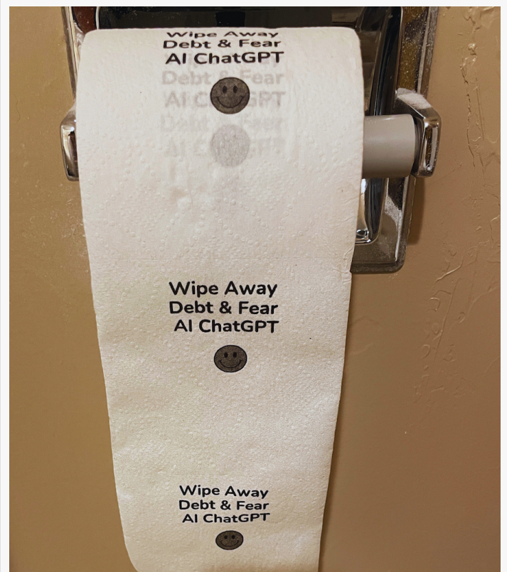
AI Toilet Paper

"We are thrilled to introduce a product that not only meets a basic need and is crucial during a