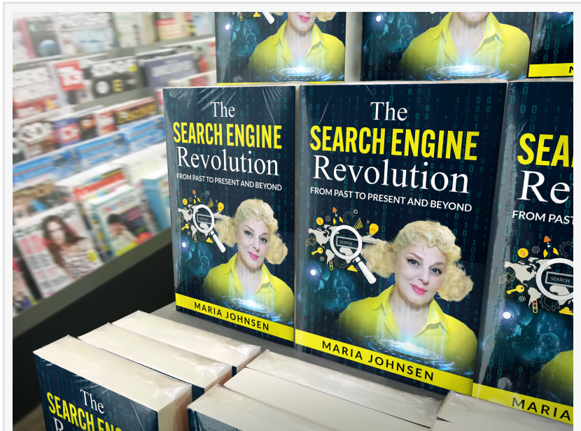
The Search Engine Revolution book