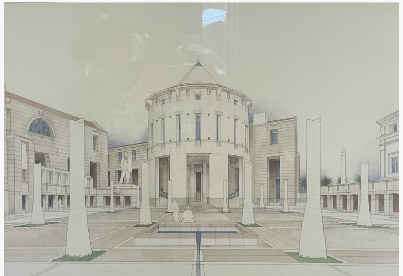
Rolando Llanes, Council Chambers of the Coral Gables Civic Center, View to the Northwest, Coral Gables Civic Center, Coral Gables, Florida (1987)

Included in the exhibition are both projects realized during the time of the fellowship, as well as recent work by these architects, designers, and planners of Cuban descent. The selection encompasses models, drawings, reports, photographs, videos, and other ephemera. They are largely drawn from the personal collections of the fellows, as well as from the CINTAS Collection, and attest to the diversity of styles and