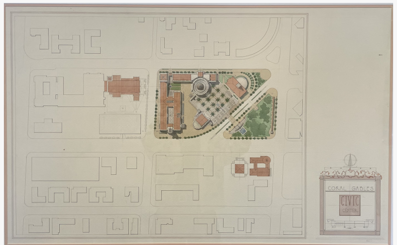
Rolando Llanes, Site Plan, Coral Gables Civic Center, Coral Gables, Florida, (1987)