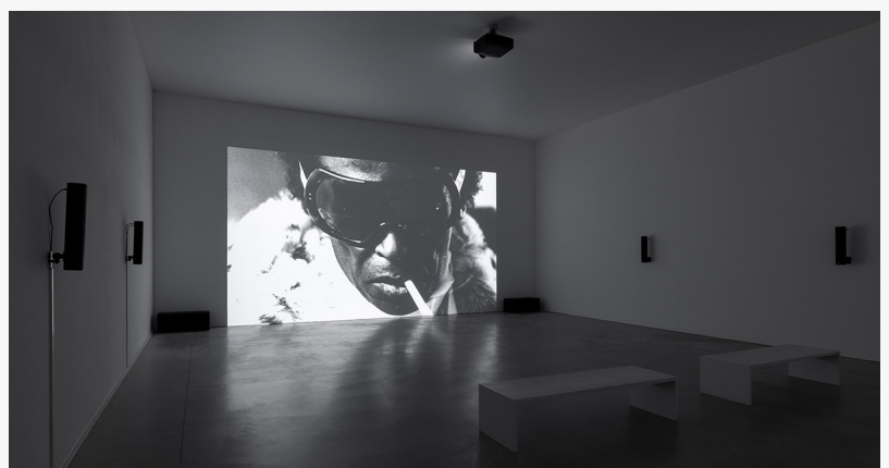
Installation view 'Arthur Jafa - SlowPEX, Luma Arles, France, 2019

Luma Westbau is pleased to present a new iteration of Hans-Ulrich Obrist first Archive exhibition dedicated to the late Édouard Glissant (1928 - 2011), Martinique-born philosopher, poet and public intellectual. Glissant is an emblematic figure for both Obrist, for whom he was a mentor, and for the Luma project in Arles, for which the thinker has been an inspiration since its inception, as for many who are finally grasping the relevance of his thought. Drawing on periods of collaboration, friendship and mentorship between the philosopher and the curator, the presentation highlights a belief they had in common: conversation and reciprocal exchange with the other can be a means to produce new realities. For Glissant, a world in transformation is a 'One-World' that listens and learns from each of its unique voices.