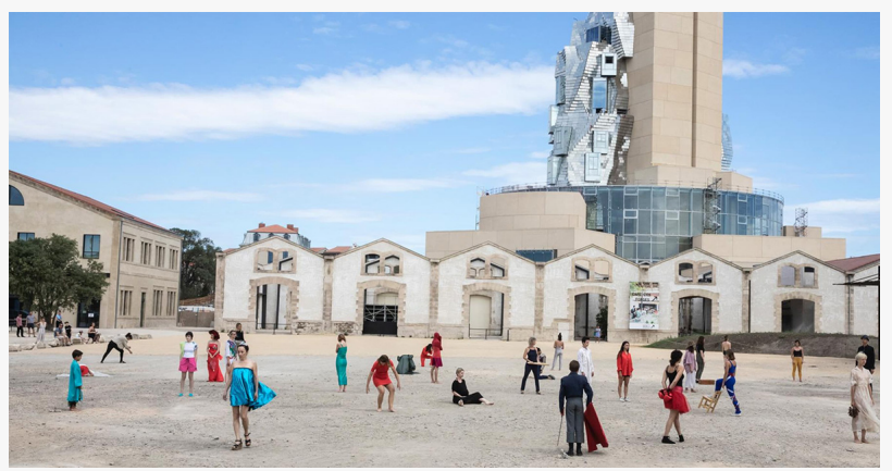
Slow Show performance, Luma Arles, France, 2019.

dialogues, reading his poetry aloud, forming and shaping his thoughts and philosophy while speaking. In addition to the videos, various other archival materials such as books dedicated to Obrist by Glissant are presented to offer a unique overview of this inspiring relationship. The presentation at Luma Westbau also features a series of posters by contemporary artists, who were either close to Glissant or who feel connected to his thinking. It is through their unique language that Glissant's ideas find prolongation, reflecting their contemporaneity and urgency.