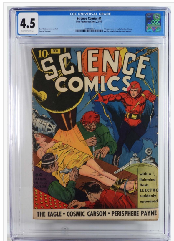
Fox Features Syndicate copy of Science Comics #1 from February 1940, graded CGC 4.5 and featuring the first appearance of The Eagle, Panther Woman and Electro (est. $3,000-$5,000).

The 1980 Kenner Star Wars: The Empire Strikes Back Luke Skywalker action figure (Bespinn Fatigues, 31 back, graded CAS 85, with straight 85 subgrades) is expected to hit $2,000-$3,000. It's a fine figure, with a crisp, unpunched card, no price sticker, clear bubble and figure and accessories factory taped. "You'd be hard pressed to find a better example," Mr. Landry said.