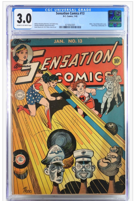
Copy of DC Comics Sensation Comics #13 (Jan. 1943), graded CGC 3.0 and featuring a classic wartime cover, by H. G. Peter, showing Wonder Woman at a bowling alley (est. $2,000-$3,000).