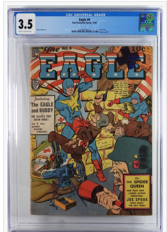
Fox Features Syndicate copy of The Eagle #4 from January 1942, graded CGC 3.5, the final issue within the series, with hanging panel with artwork by Pierce Rice (est. $3,000-$5,000).

The second is a copy of Science Comics #1 from February 1940, graded CGC 4.5 and featuring the first appearance of The Eagle, Panther Woman and Electro (who later became Dynamo), plus a classic bondage cover by George Tuska. The book is one of three in the CGG census graded 4.5. It should command $3,000-$5,000. Also in the auction will be a copy of Science Comics #3.