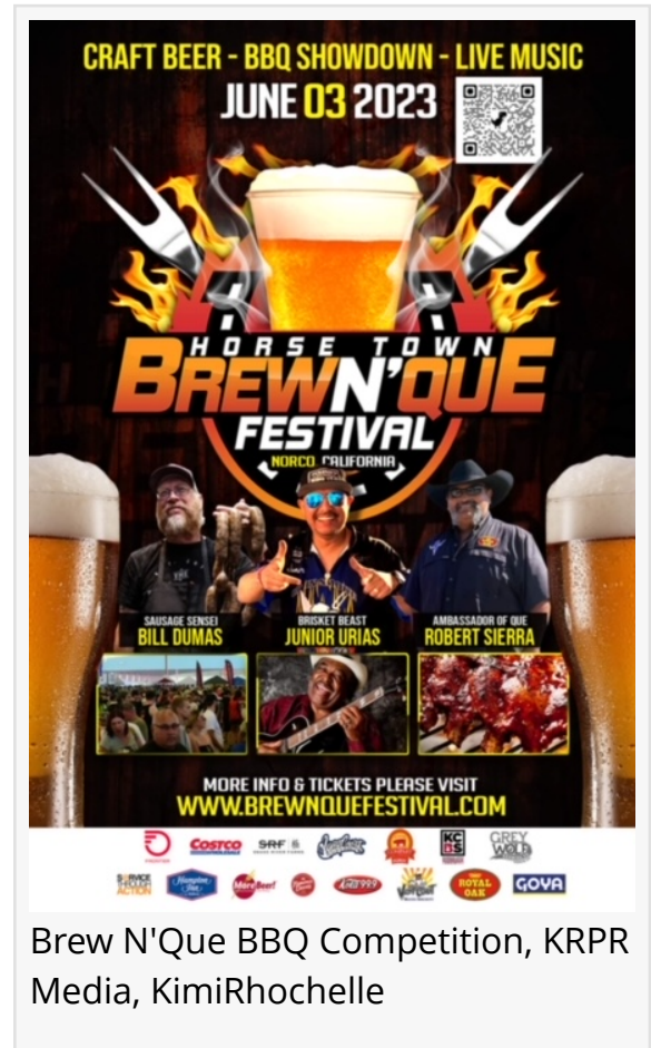
Brew N'Que BBQ Competition, KRPR Media, KimiRhochelle

“As an African American woman, I wanted to bring more diversity in competition barbeque to Norco and Southern California. I wanted to expose more people to an artform that is truly “America’s Pastime.” A large part of the festival is dedicated to children and it is critical that children look up and see someone that looks like them. Everyone can not throw a ball but