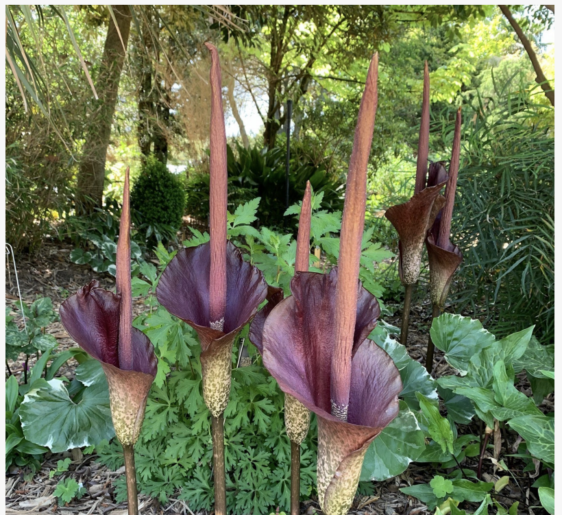
NC's Juniper Level Botanic Garden – Amorphophallus Konjac