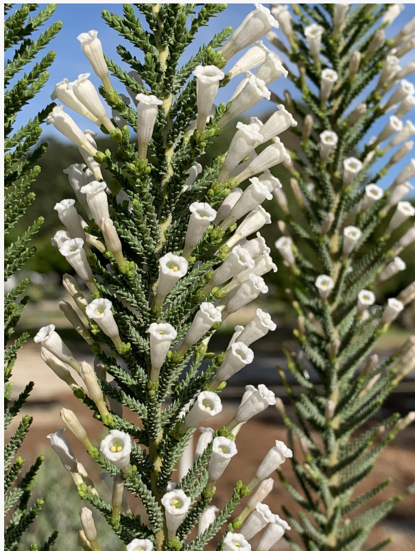
NC's Juniper Level Botanic Garden – Fabiana Imbricata