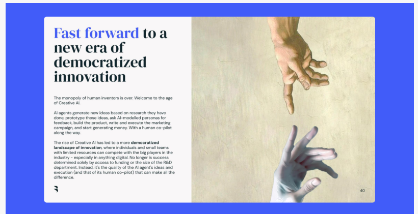
A new era of innovation