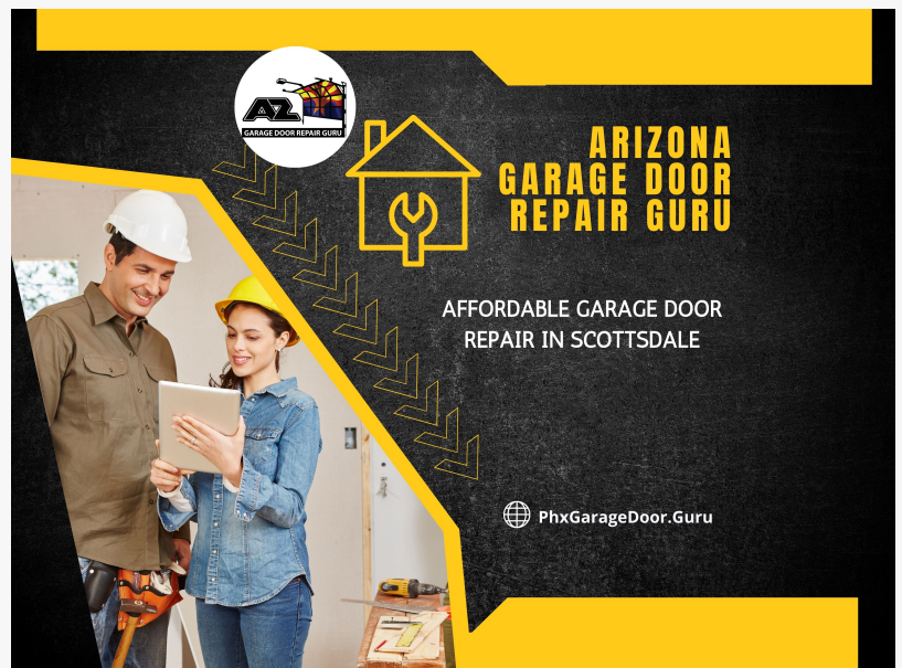
Affordable Garage Door Repair Scottsdale