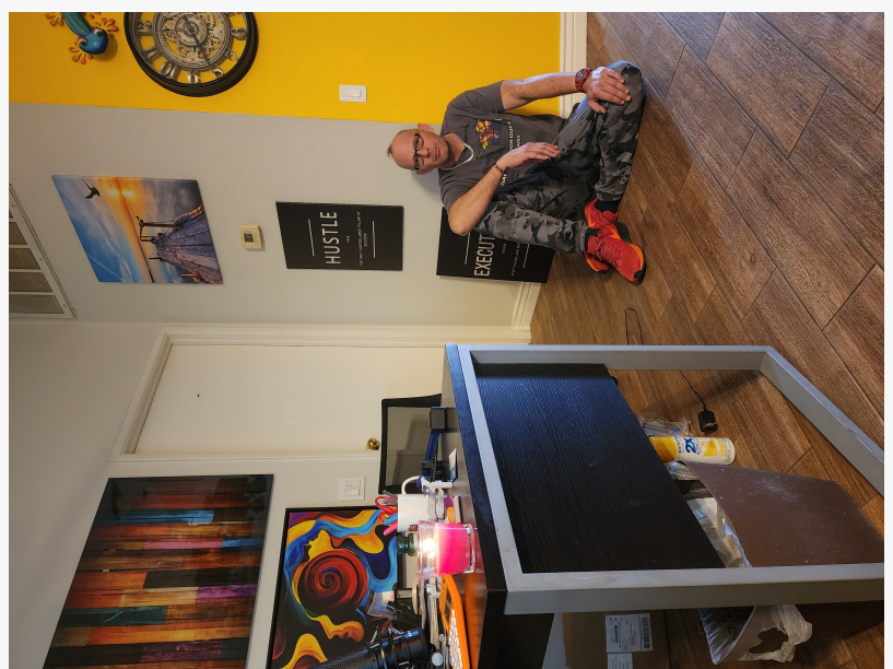
AI ChatGPT Services

One of the biggest advantages of the new AI chatbot service is its ability to provide 24/7 support to customers. Garage door issues can happen at any time, and the AI chatbot ensures that customers get quick and efficient support, even outside of regular business hours. This is especially beneficial for customers who require emergency garage door services.