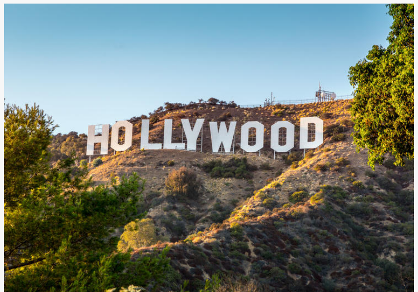
The iconic Hollywood Sign daytime fragrance named 'Hollywood Sunrise' created by Vince Spinnato

LOS ANGELES, CA, USA, April 26, 2023 /EINPresswire.com/ -- The Hollywood Sign is one of the most iconic landmarks in the world, and this year marks a very special milestone – the 100th Anniversary of its creation. For over a century this magnificent structure has towered over the Hollywood skyline beckoning to dreamers and artists from all over the world to come to Tinseltown to make their dreams come true. In 2023 the