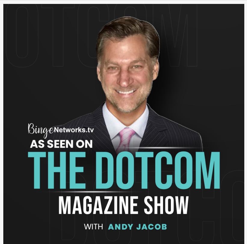
The DotCom Magazine Entrepreneur Spotlight Series-Featured Interview