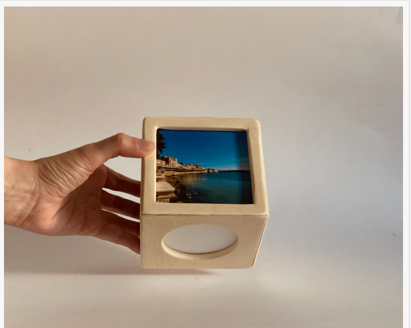
Imagine by Giulia Gringeri

Aurora DeRose Boundless Media Inc. + +1 951-870-0099 email us here