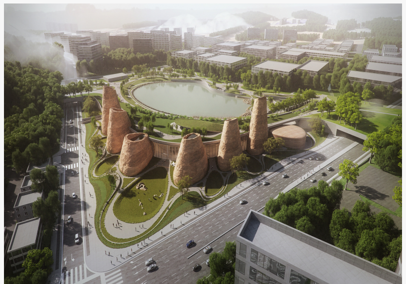
SOUR - Archeological Park, View from South