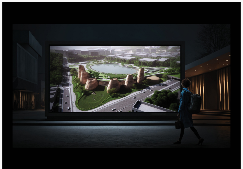
SOUR - Bird Eye View Billboard

The Metropolitan City of Incheon, together with the Housing and City Development Corporation, organized an international competition for the new Geomdan Museum Library Cultural Complex. Among 75 entries from around the world that responded to the open call, SOUR, in collaboration with Seoinn Design Group, was selected among the Final 5 to present for the second stage of evaluations in front of an international jury. The jury decision was announced by the Metropolitan City of Incheon, together with its Housing and City Development Corporation, during the ceremony at the Center for Architecture and Metropolitan Planning in Incheon, South Korea. The design team led by SOUR was awarded 4th Prize.