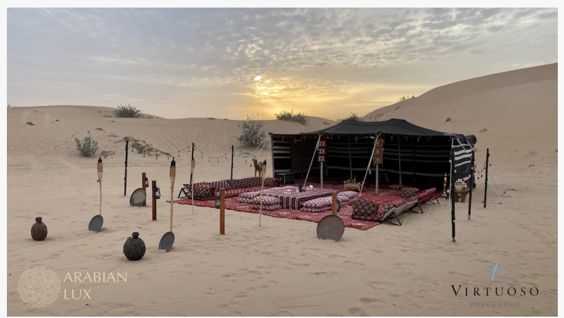
Arabian Lux Desert Experience

had the friendship and vision to trust in Arabian Lux through our early years. From the USA, to the UK, Germany, Mexico, Brazil, Chile, Singapore and Australia, the industry believed in us and gave us the chance to shine. Local suppliers and hotels also understood and recognised our vision, and trusted us to represent their brands at the highest level”.