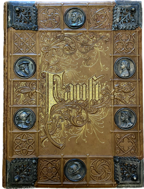
1875 Faust von Goethe – Erster Theil, Auguste von Kreiling, Friedr. Bruckmann's Verlag

This press release can be viewed online at: https://www.einpresswire.com/article/630201935