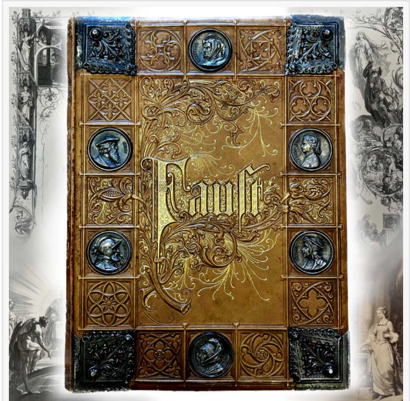
1875 – 1877 Royal Faust by Goethe

Apart from its rarity, the Royal Faust is exceptional for its size, measuring a whopping 52 x 39 cm (20.5 x 15.4 inches) and weighing a hefty 7 kg (15 lb). Nevertheless, the tome was equipped with silver corner protectors and six medals depicting portraits of the main characters. This rare publication was also one of the first to feature photographs, which was a novelty at the time.