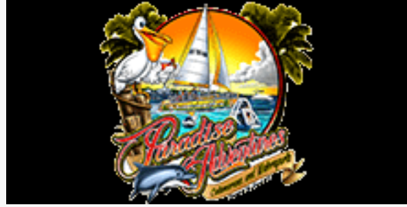
Paradise Adventures Catamaran and Watersports

2022, she obtained her 50-ton United States Coast Guard master's license.