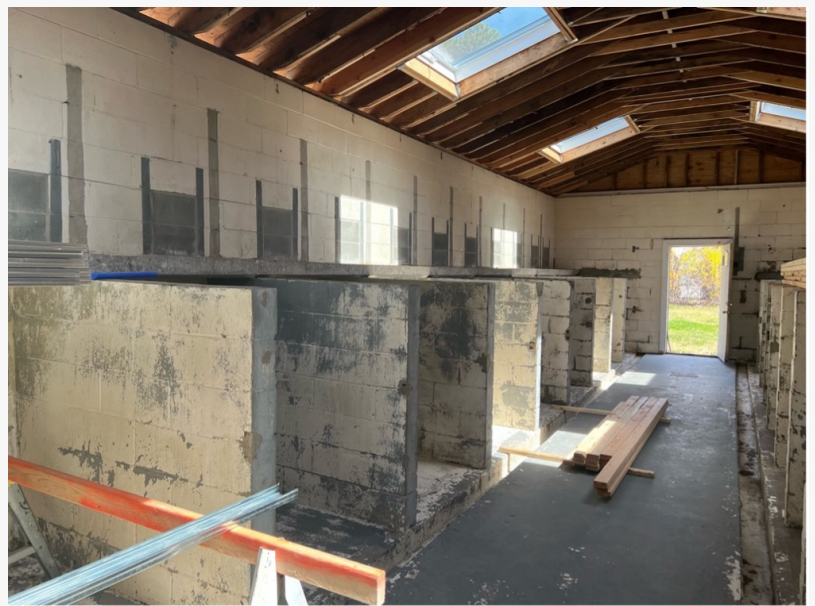
Redevelopment Rescue Dogs Rock NYC Care Facility for which fundraising is essential

Rescue Dogs Rock NYC is a 501(c)(3), volunteer and foster based rescue.