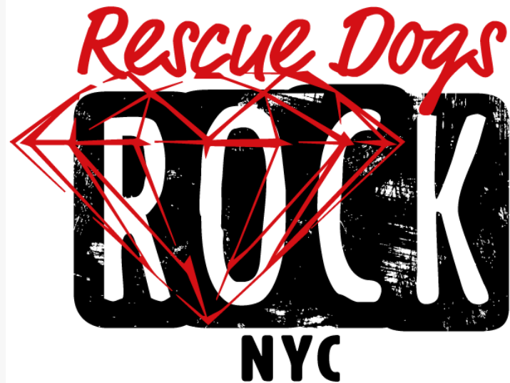
Rescue Dogs Rock NYC Logo

Rescue Dogs Rock NYC's goal is to raise awareness of the ever-growing plight of homeless animals in the United States, in shelters as well as those abandoned in the streets. There are way too many fantastic animals that are euthanized every day just because they are homeless. Rescue Dogs Rock NYC introduces these animals to the public and educates them that unwanted companion animals are not damaged goods or unworthy but can be fostered into wonderful family pets. Sadly, the abuse, neglect, cruelty, and medical cases cost shelters the most money, and often are the first animals to euthanized.