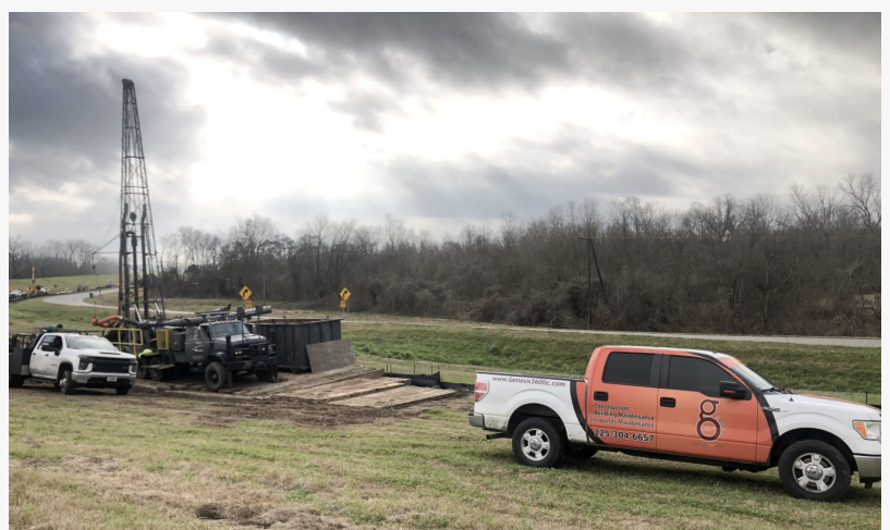
Genesis 360, LLC, works on a contract with the Army Corps of Engineers in New Roads, Louisiana.