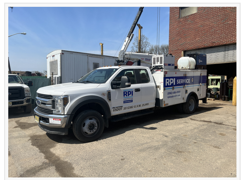
Drilling Equipment Service Maintenance and Repair

CZM EK65HP Drilling Rig: Kelly Bar, Long Mast, and Short Mast performance with drilling depths of 80' and diameters of 20 "-63."