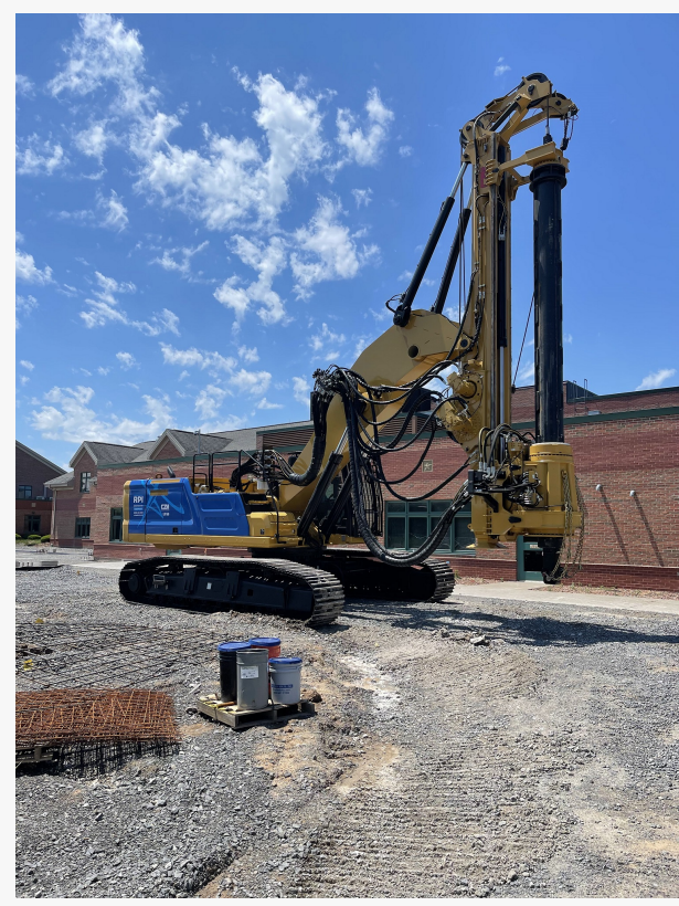
CZM LR160 Long Reach Drilling Rig