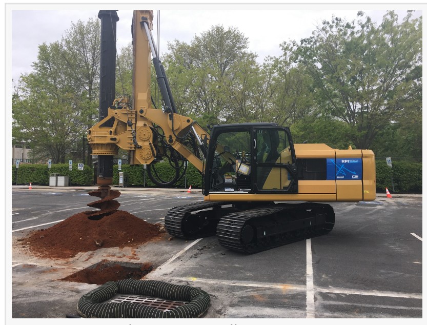
CZM EK65 HP Short Mast Drilling Rig

Selecting the right drilling rig is crucial for project success, and the guide helps operators understand the pros and cons of different drilling rigs. It encourages operators to consider unique site conditions and soil conditions to determine the right piece of machinery to add to an existing fleet. The guide also provides general cost guidelines for purchasing a drilling rig and explores alternatives such as drill rig rental solutions and financing options.