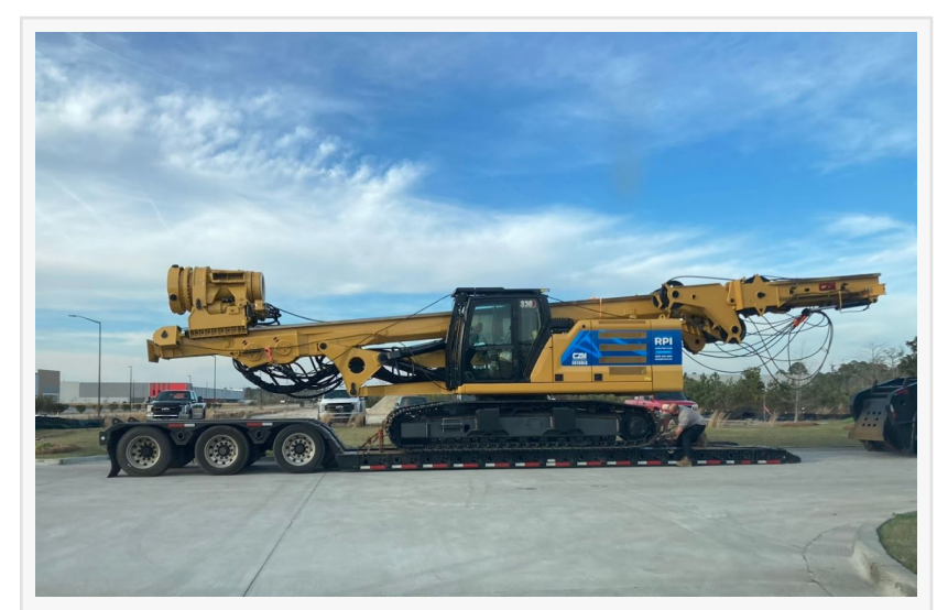
CZM EK160 LS Cable Crowd Drill Rig

To help drilling contractors navigate these challenges, RPI Equipment's guide offers in-depth knowledge of the fundamentals of foundation drilling. It covers different types of drilling