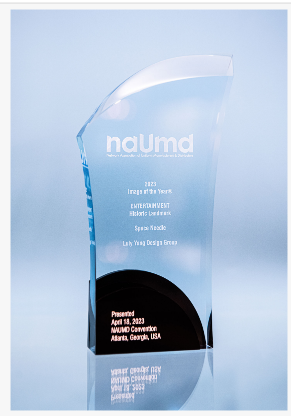
NAUMD Image of the Year Award - Luly Yang for Space Needle

Like the Space Needle in 1962, Yang brought innovation and modern styling to the new uniform collection. With