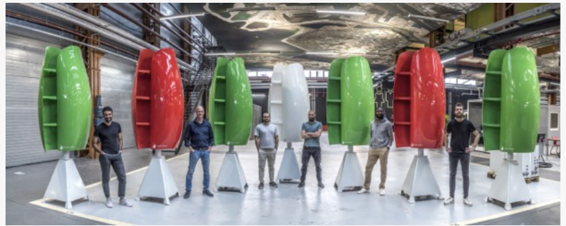
Flower Turbines Panorama