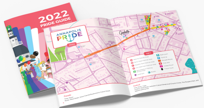
Annapolis Pride 2022 Parade + Festival award-winning brochure design

This press release can be viewed online at: https://www.einpresswire.com/article/630426960