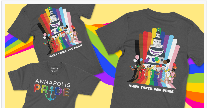
Annapolis Pride 2022 Parade + Festival award-winning shirt design