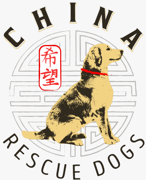
China Rescue Dogs Logo