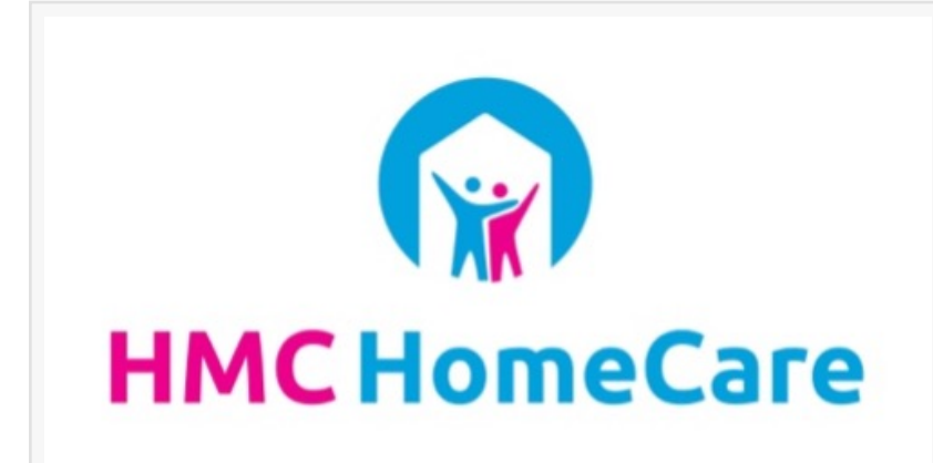
HMC HomeCare Logo

About HMC HomeCare HMC HomeCare was conceived within Hawaii Medical College as they recognized the growing need for