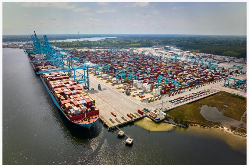
Aerial view of Port of Virginia showing ships with containers.

/EINPresswire.com/ -- The City of Virginia Beach is pleased to report a successful and well-attended 2023 State-of-the-Port address, which took place at the Virginia Beach Oceanfront on April 26-27. The two-day event, presented by the Hampton Roads Global Commerce Council (HRGCC), showcased The Port of Virginia's remarkable performance over the past year and plans for the future. The City was thrilled to welcome nearly 500 industry professionals to this event, which is a testament to the significance of the port's role in the economic growth and development of the Commonwealth.