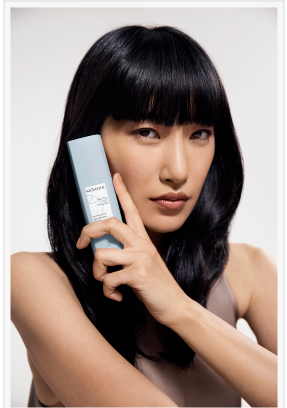
The KERASILK range is suitable for all hair types and textures. | Product: Taming Balm

This press release can be viewed online at: https://www.einpresswire.com/article/630845329