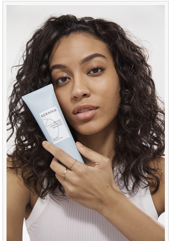
The KERASILK range is suitable for all hair types and textures | Product: Curly Hair Balm

KERASILK is a professional hair treatment brand created by Goldwell. It offers a range of customizable treatments that help to improve the overall texture and manageability of the hair. These treatments use advanced technology to penetrate deep into the hair fibres to provide