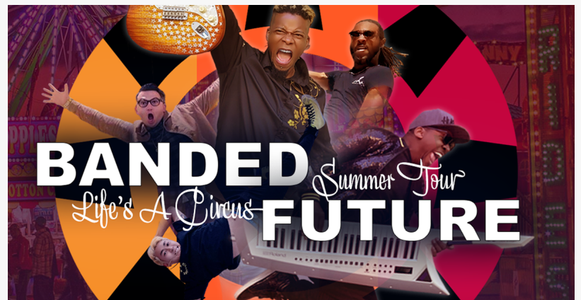
Banded Future kicks off summer tour with The Unlimited Taco & Music Fest.