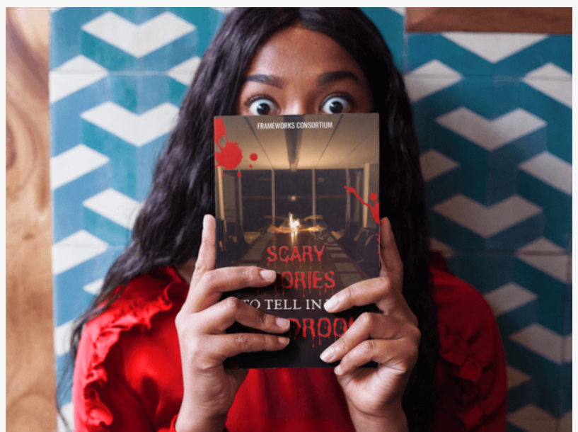
Scary Stories to Tell in the Boardroom - too scary NOT to read!

Frameworks Consortium LLC, a group that helps small and medium-sized businesses achieve success, has announced the upcoming release of Scary Stories to Tell in the Boardroom , a book written by experienced service providers who want to help business leaders prevent dangerous situations in their own businesses. The book comprises case studies on common issues that business owners struggle with and may sometimes even cause catastrophic business failure - all told with with a horrific, supernatural twist.