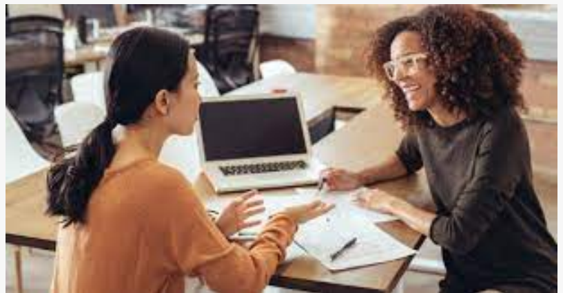
Mentoring is Key To Career Success

Aventura Tutors' mentoring program is designed to help graduates develop critical thinking, problem-solving, and communication skills, as well as providing guidance on career planning in