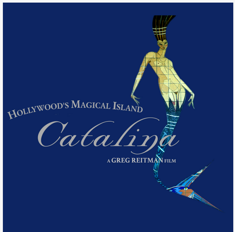
Hollywood's Magical Island - Catalina A Greg Reitman Film