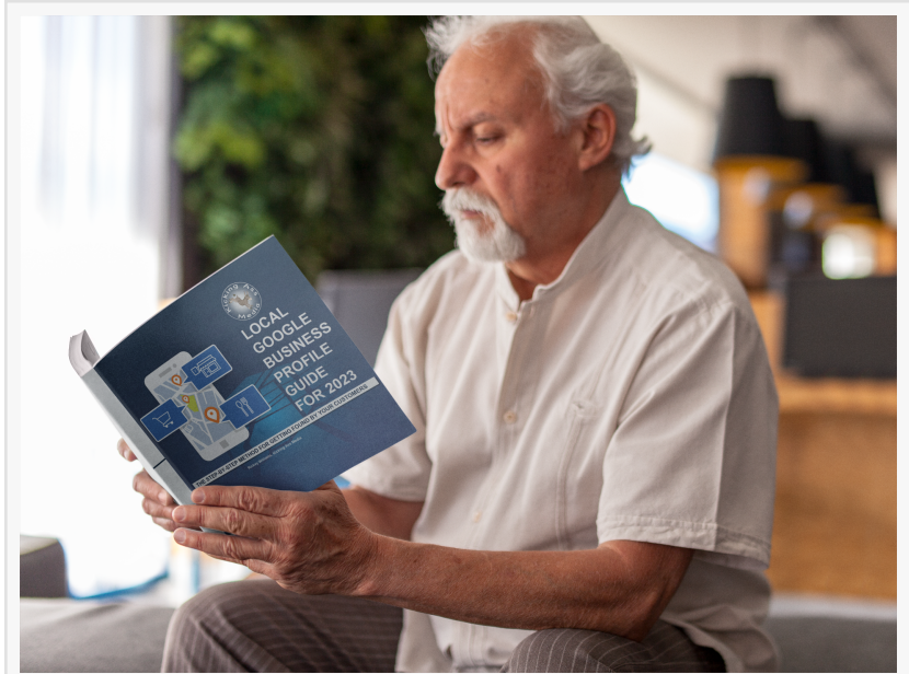
Learning how to optimize Google Business Profile.

MEDFORD, OREGON, UNITED STATES, May 2, 2023 /EINPresswire.com/ -- Kicking Ass Media LLC is proud to announce the launch of its latest offering - the Google Business Profile Do It Yourself Guide. The guide is designed to provide local businesses with a roadmap to optimize their Google Business Profiles to rank higher organically in Google search and in the Google local map pack.