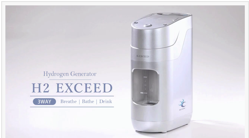
Hydrogen generator H2 Exceed for health and beauty

1. Enhanced Skin Health: Hydrogen-rich water promotes skin hydration and elasticity, reducing the appearance of fine lines and wrinkles. Users will experience a more youthful and radiant complexion.