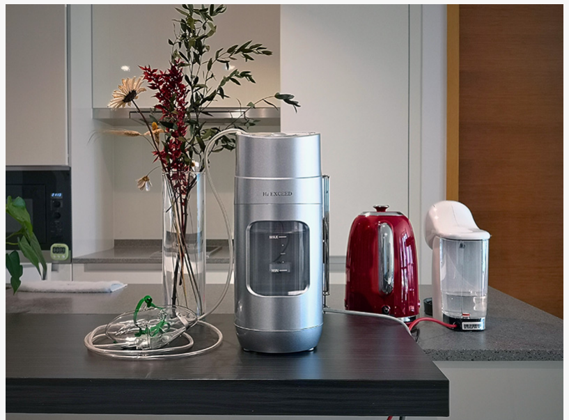
Hydrogen generator H2 Exceed for health and beauty is a nice room interior