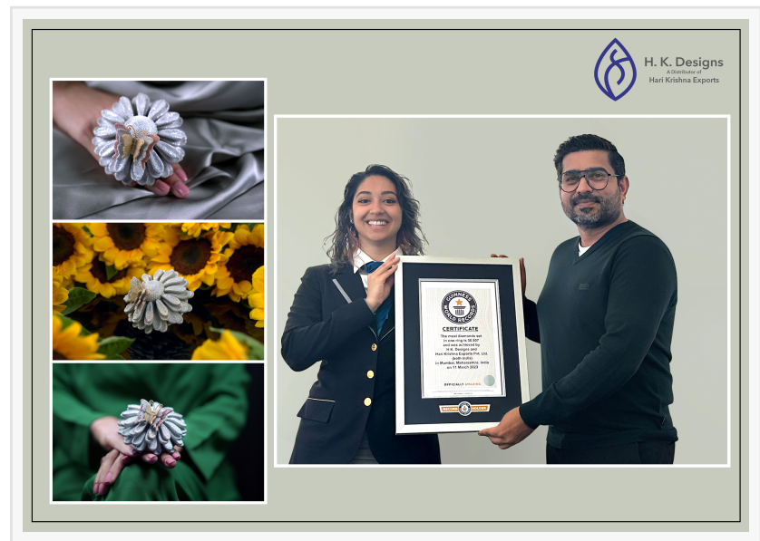
Guinness World Record-Setting Ring to Dazzle Visitors at GemGenève Show in Switzerland

Inspired by a sunflower's vibrant and beautiful design, the Ring comprises four layers of petals, the shank, two diamond discs, and a butterfly. The meticulous crafting process involved