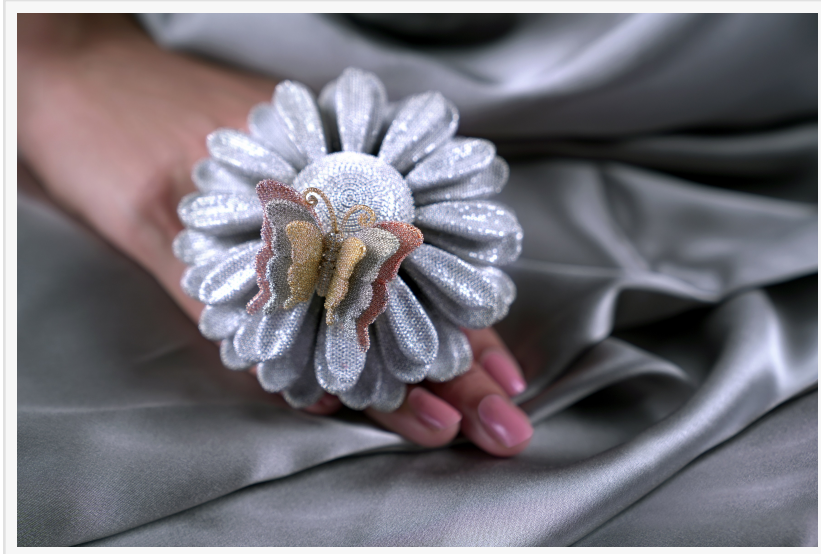
Guinness World Record Ring by HK Exports at GemGenève Show, Switzerland

The Ring's creators have been dedicated to environmental causes and sustainability initiatives. To demonstrate their commitment, they have pledged to plant one tree for every diamond set in the Ring. This commitment highlights their goal to support climate action and contribute to a sustainable future.