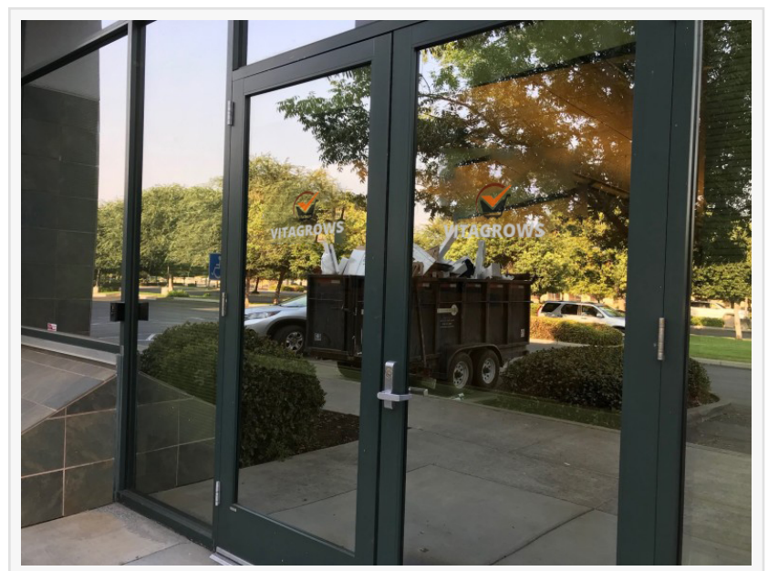
Vitagrows: Making Strides in the E-Commerce Industry with New Technology Hub and Record Sales

LONDON, ENGLAND, UNITED KINGDOM, May 1, 2023 /EINPresswire.com/ -- Vitagrows, a popular online home improvement retailer with headquarters in Sharjah, is making waves in the e-commerce industry. The company has recently established a technology hub in Muwailih Commercial - Sharjah to better serve its customers online. This expansion has allowed the company to offer a wider range of home improvement products to its clientele, from outdoor appliances to garden supplies.