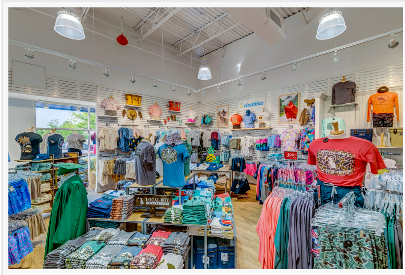
Palmetto Moon Store Interior Displays

"We are thrilled to open our newest store in Clarksville and can't wait to welcome the local community and loyal